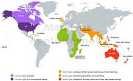
English Speaking Countries Five Branches of World English

These lessons concentrate on building up vocabulary through reading, listening, writing and speaking on and about a whole variety of subjects enabling students to expand their knowledge of words and reinforce their linguistic capabilities